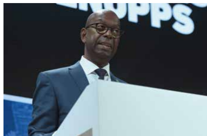
Bob Collymore, Safaricom CEO

Effective tax systems matter for the growth of modern and inclusive economies. Tax is a policy tool that governments use to achieve their objectives, such as stimulating job creation, capital investment in particular sectors or locations or encouraging environmental or social outcomes. What is most important for businesses is informed and fair policy making and regulation, an independent judiciary and respect for the rule of law. Uncertain or poorly designed tax rules are a barrier to investment. When this is compounded by poor understanding of the intention of a particular policy initiative or tax instrument, it can become major source of distrust between government, citizens and the private sector.